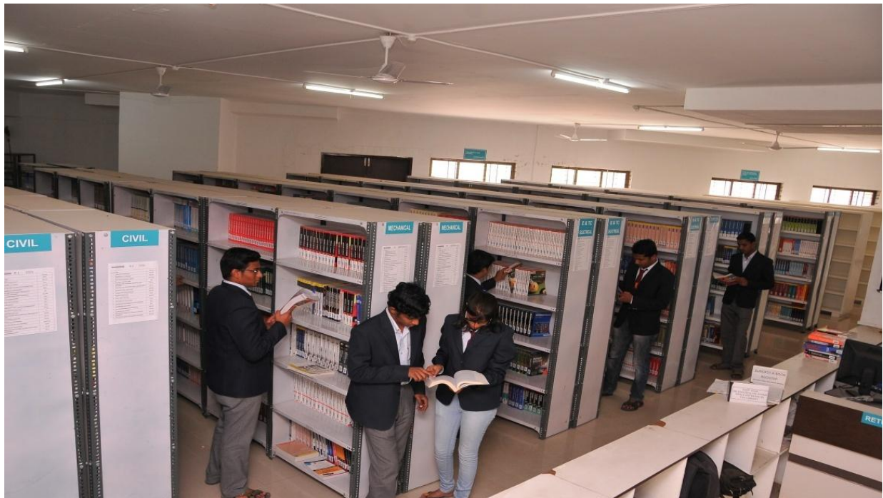
Library Reading Hall