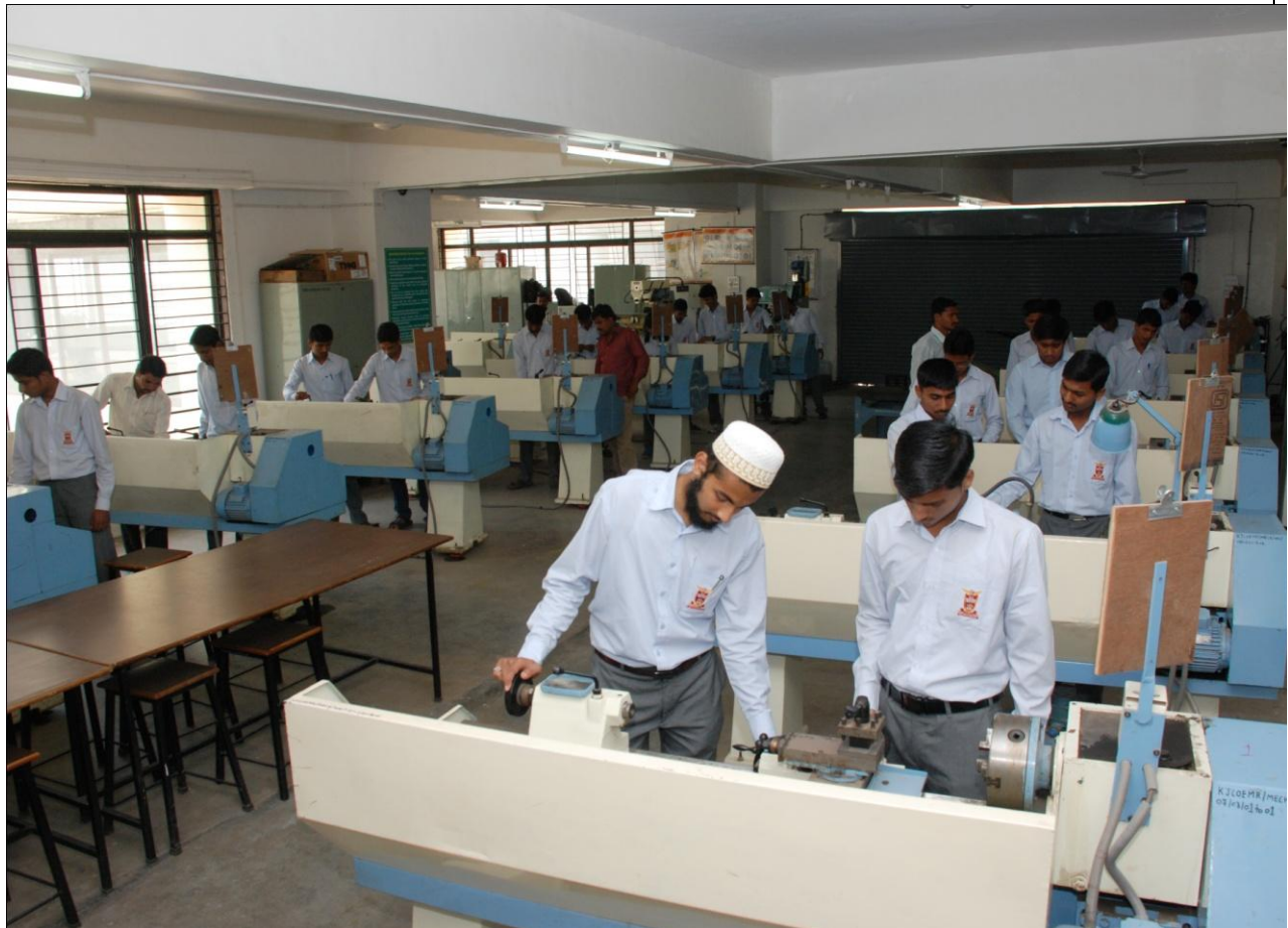
Steam Power Plant